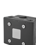
IP Mounting Bracket Ref. 8015300142