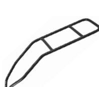
IP Mounting Bar Ref. 8015300141