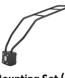
IP Mounting Set (Bar + Bracket) Ref. 8015300145