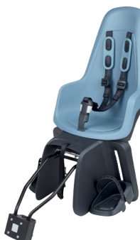
IP & E-BD