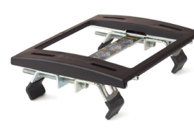
E-bike Luggage Carrier EASY Mount System (E-BD) Ref. 8015300339